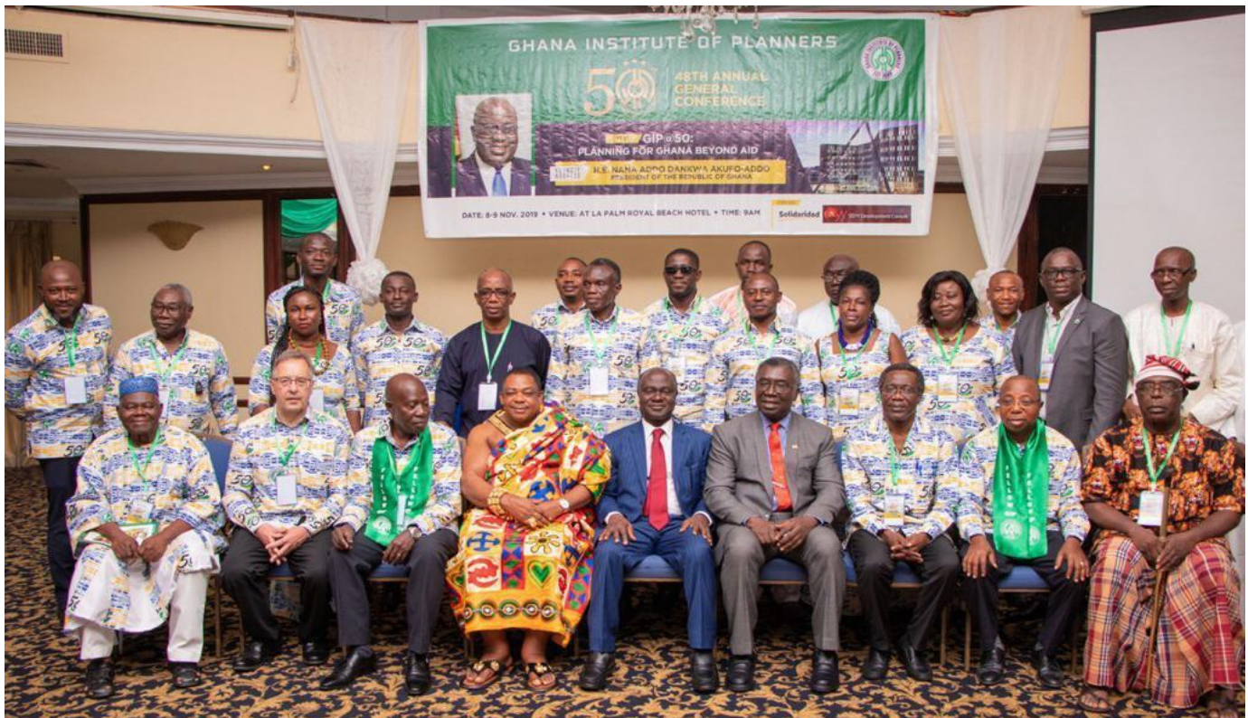
A group picture showing GIP members, invited guest, Snr. Planners & Staff of DoP. KNUST & UDS