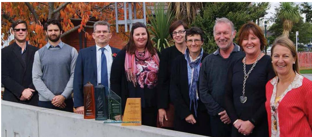
Outstanding Planning Achievement Award winners from New Zealand

The 2019 CAP Award for Outstanding Planning Achievement in the Commonwealth was awarded to the Draft Waimakariri Residential Red Recovery Plan by Waimakariri District Council in New Zealand. Further details are available here